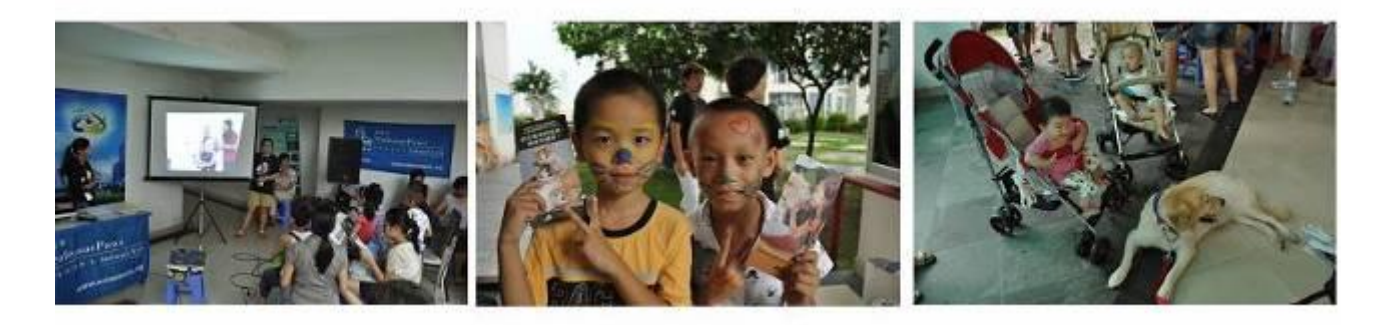
Children of Huanggang community promise to be responsible dog guardians.

We launched our responsible dog ownership public education programme in Shenzhen Changfengyuan community and this time we delivered leaflets to passers by on the street and invited them to participate in the event. Through fun games, children and parents learnt how to care for animals. We also carried out the promotional activities in Huanggang community, working together with the local community stations.