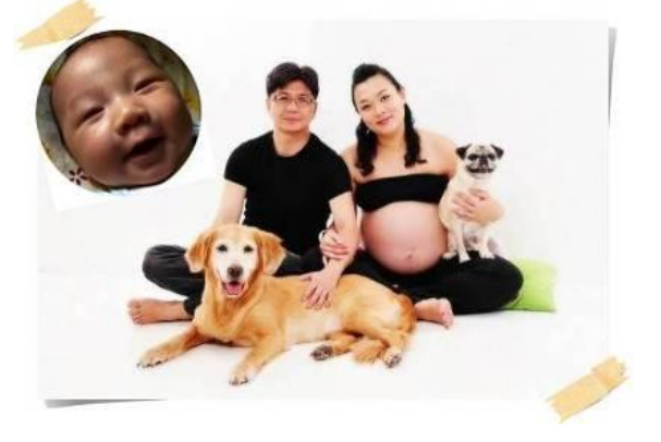
Hello! We are Wu's family!