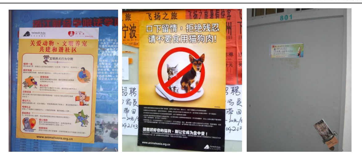
Posters and leaflets were sent to students' dormitories in different universities of Zhejiang.

Animals Asia China Cat and Dog Welfare Team Animals Asia HK Dr Dog and Pro Paws Team July, 2012